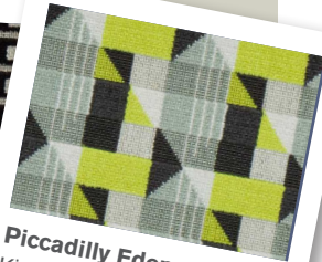
Piccadilly Eden Kirkbydesign.com

As well as the new Underground collection, Kirkby Design also has other collections including Chester and Canvas.