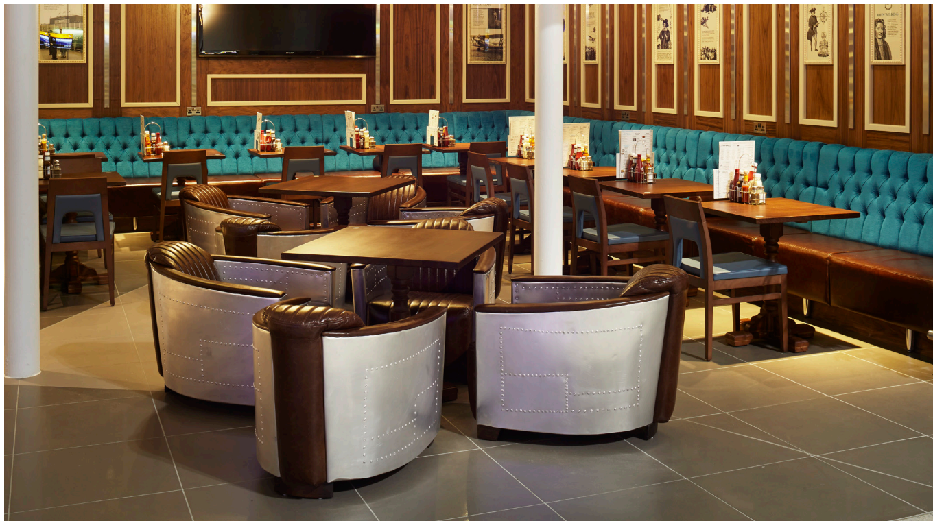
The Flying Chariot