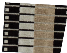
Marylebone Havana Kirkbydesign.com

Some of our favourite fabrics are from the Underground collection at Kirkby Design: