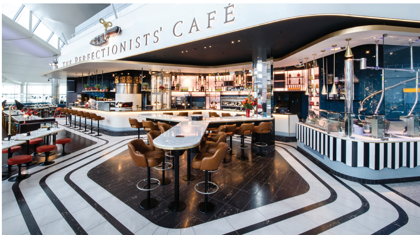
The Perfectionist's Café